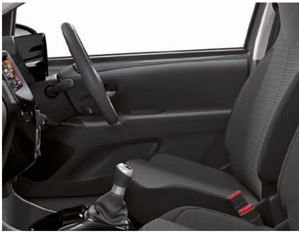
Grey 'Wave' cloth Standard on Flair versions