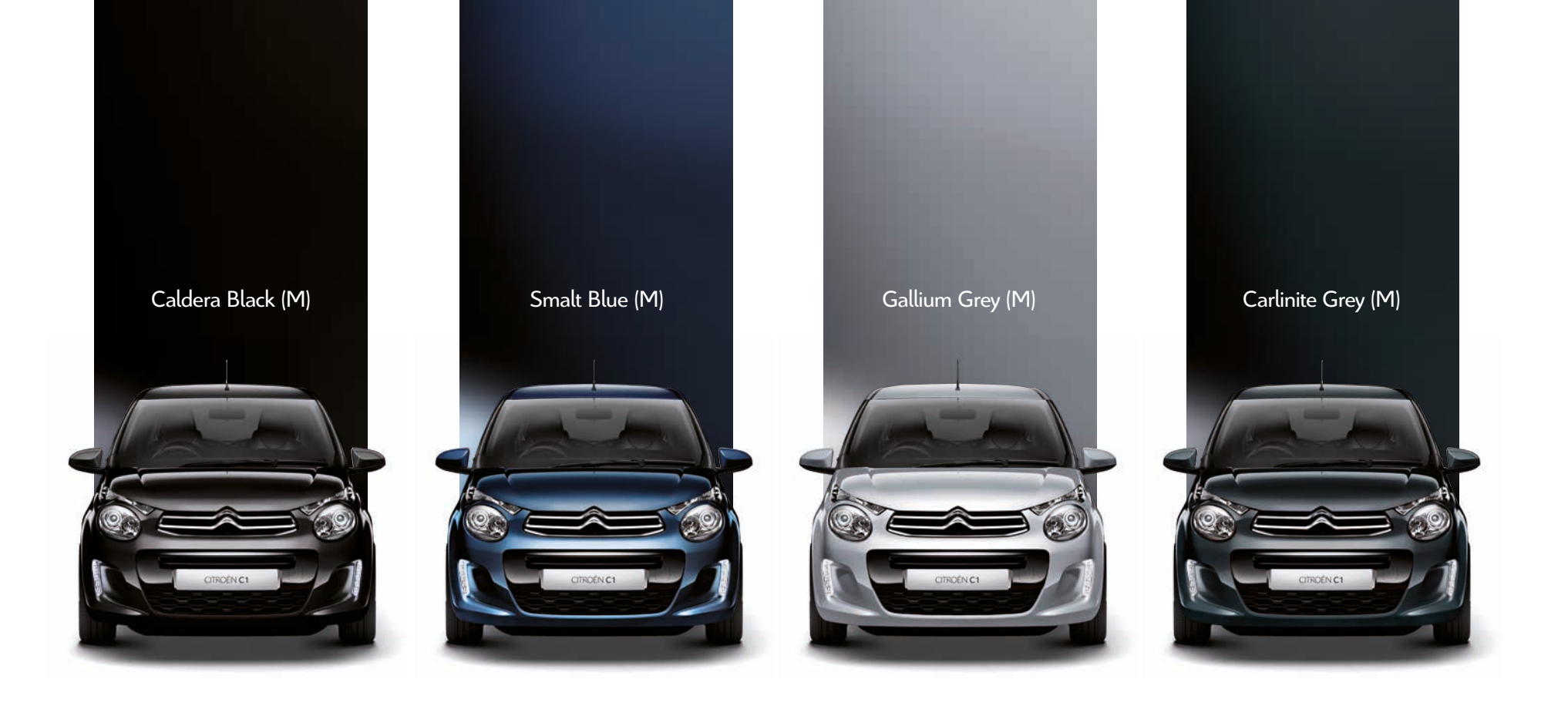
[M] Metallic Please note: Colours and pictures shown are for illustration purposes only. Please consult your Dealer for definitive colour and trim/upholstery details.