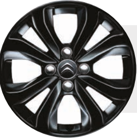
15 inch black 'Planet' alloy wheels Optional on Feel & Flair versions