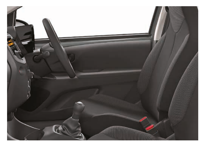
Grey 'Mica' cloth Standard on Touch versions