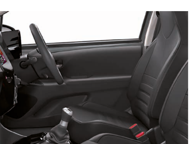
Black leather Optional on Flair versions. Unavailable on Airscape versions.